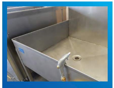
A standard 2" NPT stainless steel drain fitting requires connection to a water drain.