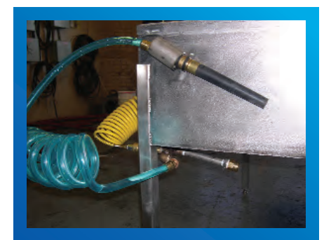
Available options include a water hose attachment for flushing out water lines and other intricate areas. The flushing hose requires a customer supplied water source.