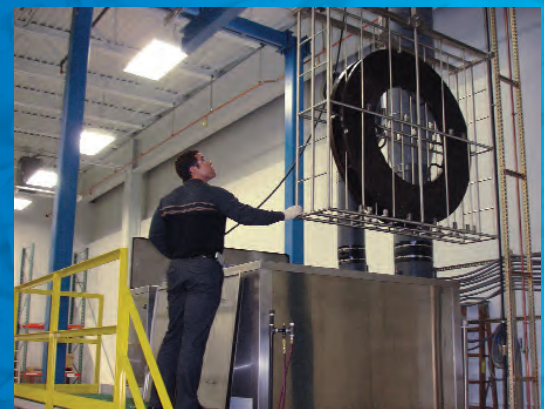
This heavy-duty fixture accommodates two large rubber molds or many smaller molds depending on their size. The fixture works in conjunction with an overhead hoist when transferring the part from the clean, rinse, and rust inhibiting tanks.