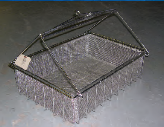
The standard sized basket for a CC-1825 console cleaner can be used with or without the mesh insert pictured above.