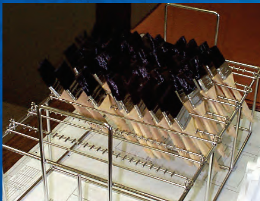
This custom fixture was built to maximize the number of brushes that were cleaned per cycle. Stacking the brushes in this fixture ensures each brush is exposed to the ultrasonic cleaning power within the tank.